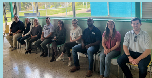
Featured: Association of Builders and Contractors (ABC) - Mississippi Chapter Young Professionals who helped assess the renovation needs of Hope Village's future Recreation Center

We are privileged to have been chosen by the Mississippi Chapter of Association of Builders and Contractors (ABC) as 2023 charity of the year! We are so excited to see how the Young Professionals will transform our Recreation Center. The kids are going to love it!