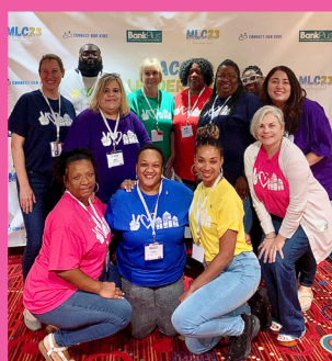
We enjoyed representing in our "PEACE, LOVE, HOPE VILLAGE" t-shirts.